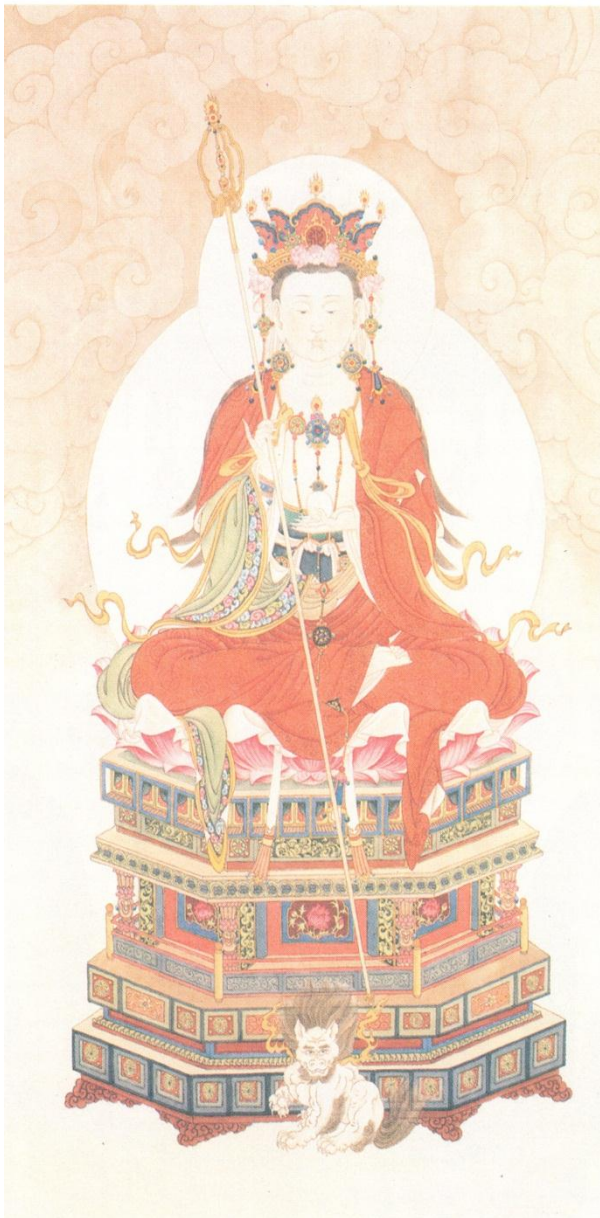
Earth Store Bodhisattva